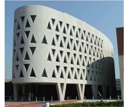
RICHARD E. LINDNER CENTER Between field house & stadium

Price: $ 25.00 for members, $35.00 non-members, No Charge for students, cash or check at door.